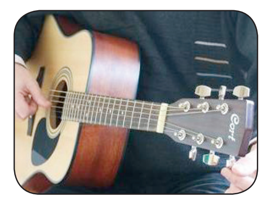
Turn outside tuning head